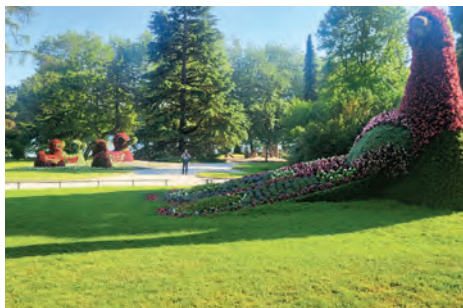
Topiary on Mainau Island

roses beautifying the area, beyond which Lake Constance was an ever present backdrop.