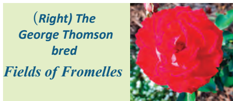
(Right) The George Thomson bred Fields of Fromelles