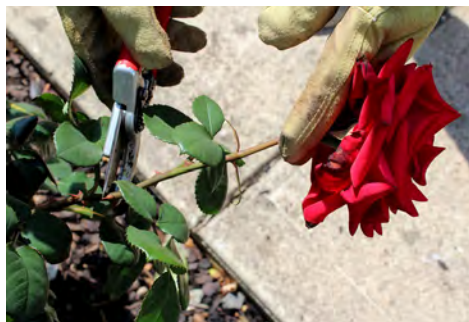
Spent blooms should be "deadheaded" to encourage further flowering.

A non-performing rose bush is a sign that it is lacking fertiliser or may be diseased.