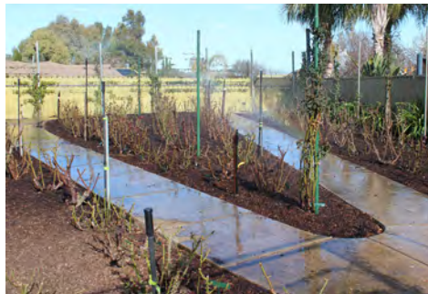
Whoflungdung, the Neutrog mulch recommended by the RSSA.