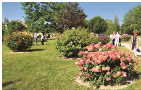
A small section of rose garden at Estavayer-le-lac

We re-entered Switzerland the next day for a tour of the FELCO factory where many of us bought snips and other FELCO products. We were also supplied with a tasty lunch. Then it was off to a winery, Auvernier Castle, where we sat under a huge old cherry tree with a magnificent view over vineyards and a lake in the background, all the while sampling an array of locally made produce!