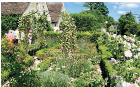
Herb garden and roses at the old monastery, located in Kartause