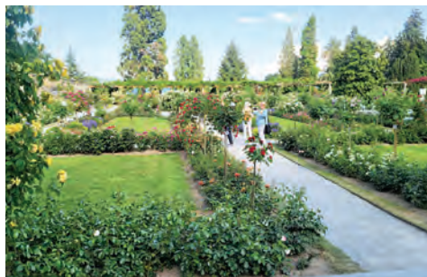
A rose garden on Mainau Island