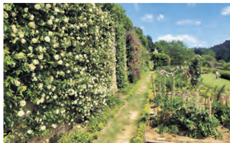
Espaliered plants, Gardenia in the foreground, at Grand Chateau d'Ansembourg