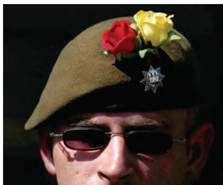
A soldier from the Anglian Regiment with the yellow and red rose worn as a tribute to Minden Day.