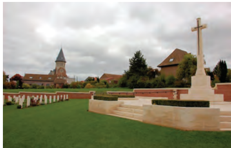
A section of the War Graves and memorial at Fromelles.