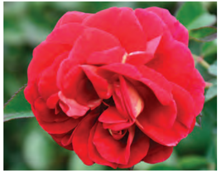
No Surrender

No Surrender is such a fitting name because the siege started in April 1942 and the Australians were not relieved until December of that year. German propaganda described the men as “living like rats.” The Australians took this as a badge of honour and struck an unofficial badge with a rat across it with the words, “No Surrender!” Subsequently, the monika, The Rats of Tobruk , was “born”. The rose, winner of a Bronze Medal in