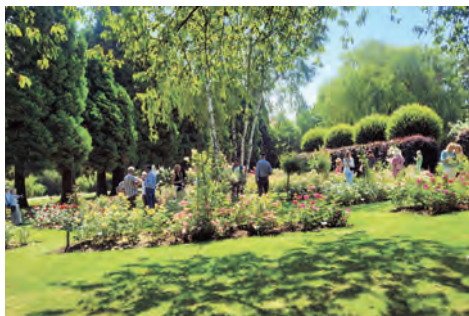
Old trees and shrub "hedges" flanking beds of roses at Landhaus