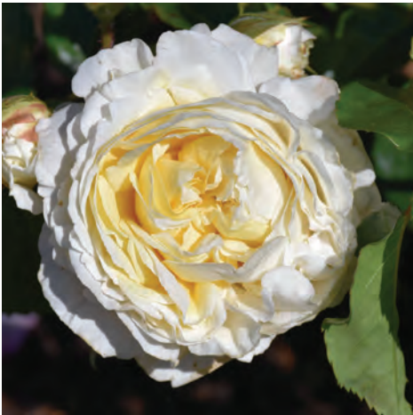
Code / Name: VISILOST Type: Floribunda Breeder: Martin Vissers (Landsdale Rose Gardens)