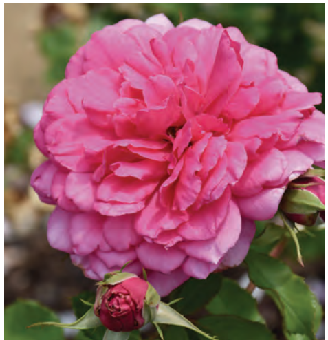
Code / Name: 4076

Breeder: W. Kordes' Söhne (Trelor Roses)