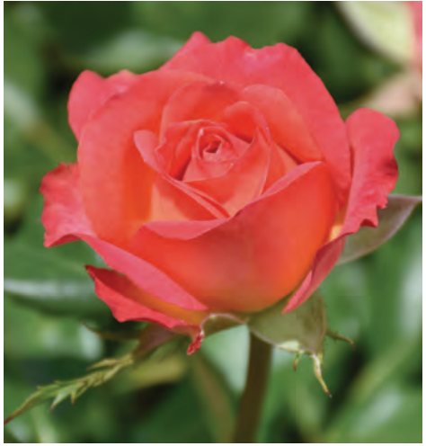
Code / Name: Korcolipas Vulcano Type: Grandiflora Breeder: W. Kordes' Söhne (Treloar Roses)