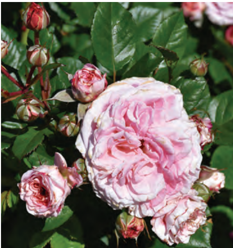
Code / Name: Korknaufoc

Breeder: W. Kordes' Söhne (Trelor Roses)