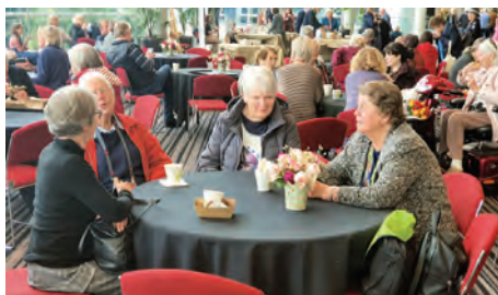
Chaffey Rose Club members