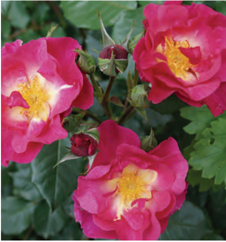
Code / Name: FRlaboutu Amber's Gift Type: Floribunda Breeder: Mary Frick