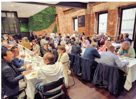
Friends of the Federation dined at the Strathmore Hotel for their traditional celebratory dinner.

Although rain came down in one of the coldest and wettest Springs in a decade,