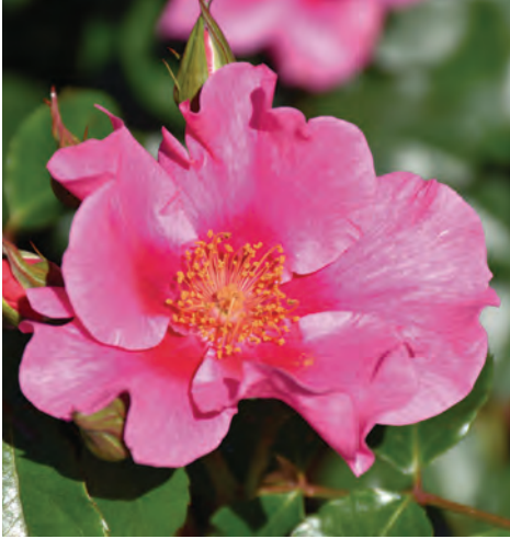
Code / Name: Korhulth002 See You In Pink Type: Floribunda Breeder: W. Kordes' Söhne (Treloar Roses)