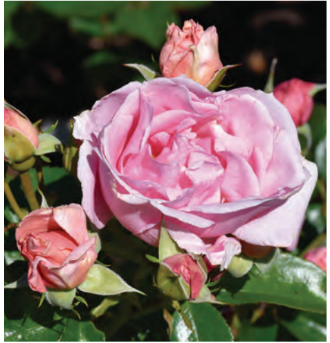
Code / Name: Koraugneru Love Affair

Breeder: Rose Barni (Wagner's Rose Nursery)