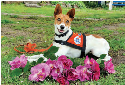
Lions Hearing Dog, Lan, with the dashing blooms of Amber's Gift .