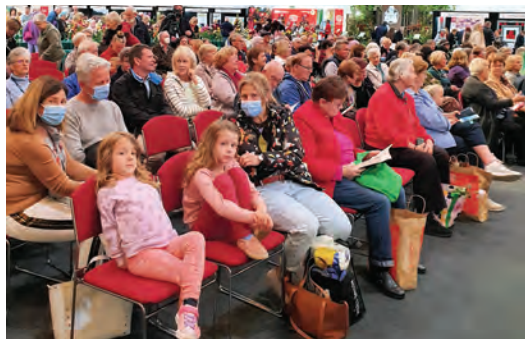
The speaker's program was a big drawcard for all ages throughout the Expo.

Many were keen to see the 10,000 rose blooms, donated to the Expo and Convention by the House of Meiland. These were put to good use by members of the Woodville Academy of Floral Design who created dramatic and colourful large arrangements for the Expo and the Convention.