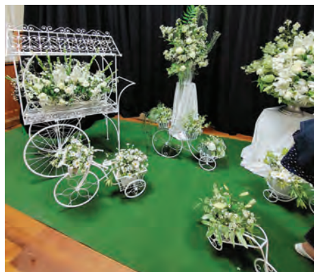
Stunning displays in the Institute for the Riverland Rose and Garden Festival

Next, for members opening their gardens and those setting up and or helping with the Institute display for the Riverland Rose and Garden Festival, it was time for final preparations.