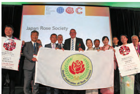
The handover of the Federation flag to Fukuyama City, which will host the 2025 World Convention— Roses for the Future