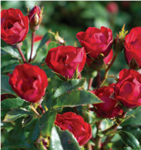
Code / Name: Meibenbino Zepeti Type: Miniature Breeder: Meilland International (Corporate Roses)