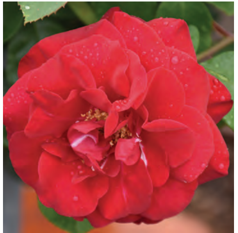
Code / Name: 8809-09-HF Type: Climber Breeder: Meiland International (Corporate Roses)