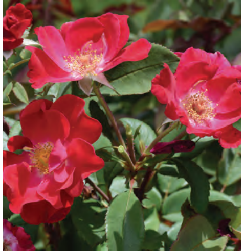
Code / Name: X566-B1 Type: Shrub Breeder: Tom Carruth, Weeks Rose (Swanes's Nurseries)