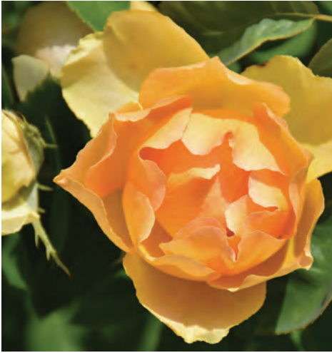
Code / Name: BAR PEJ 6564 Paolo Pejrone Giardiniere