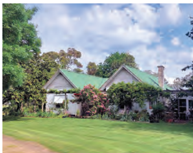
Image: A mantle of green, punctuated by Pinkie CL in bloom to the front of the home.

Those that remain have been pruned, giving the garden a more open look with the view over the paddocks and old red gums being very attractive. This has also meant that plants have a lot more sunlight and roses that were smothered by greenery now have a new lease on life, although some of them may prove to be Rosa canina or Dr. Huey ! But never mind, they are all attractive garden plants!