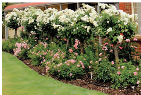
Whoflungdung applied

The second option is to keep the rose flowering with the continuous removal of spent blooms and plenty of water, plus applications of liquid Sudden Impact for Roses every two weeks in January.